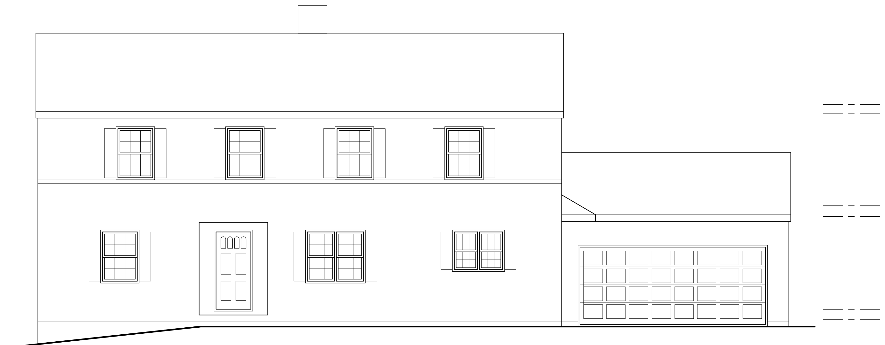
1 FRONT ELEVATION SCALE: 1/4" = 1'-0"