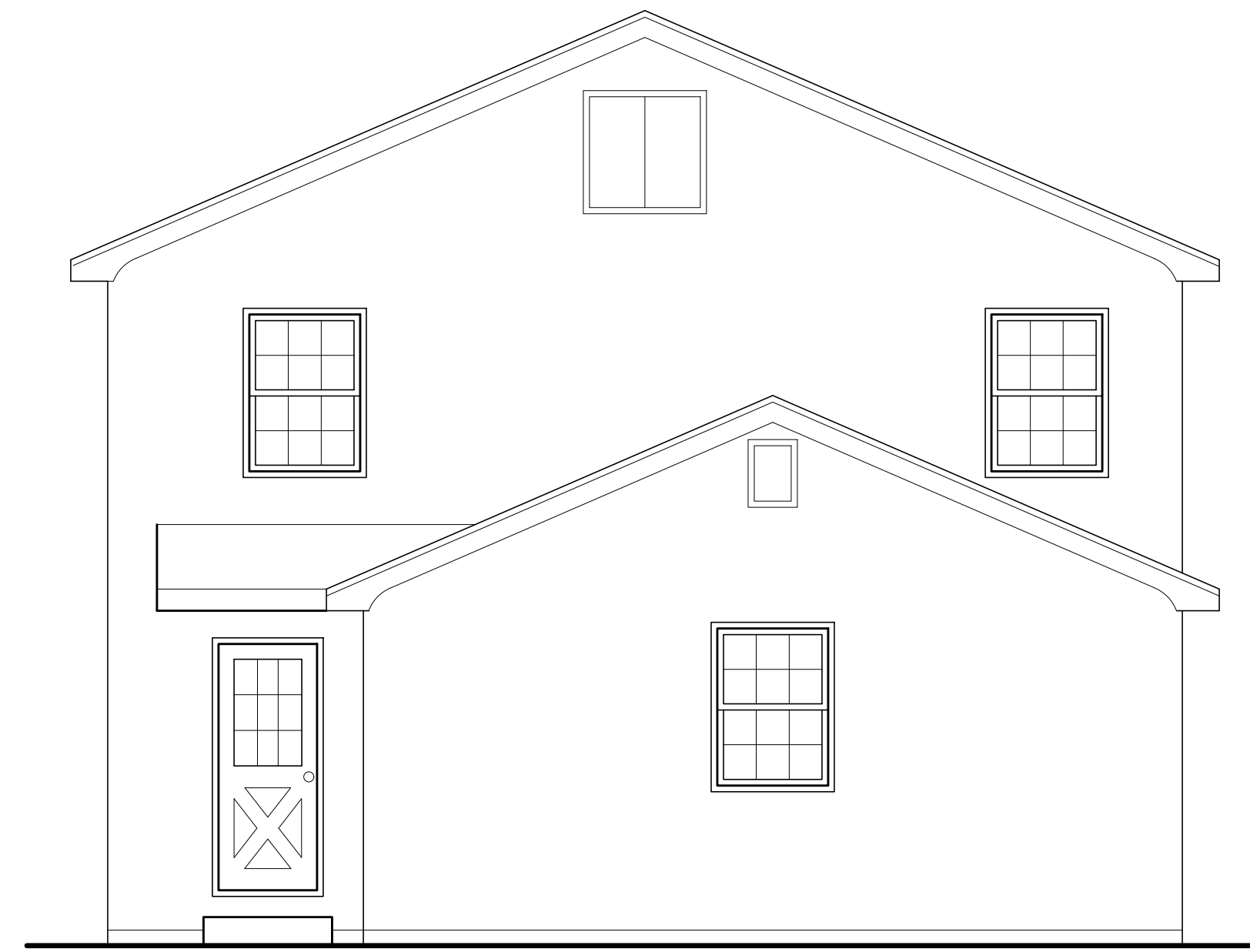
2 SIDE ELEVATION SCALE: 1/4" = 1'-0"