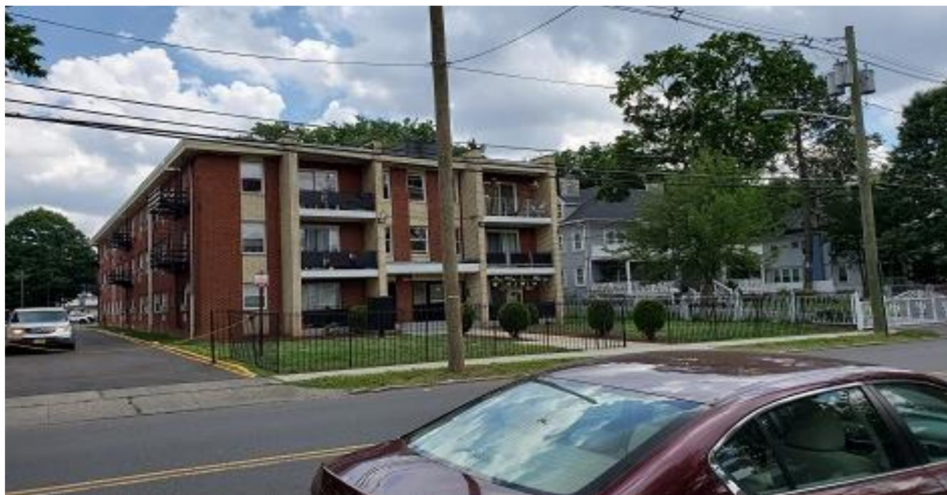
Image 8. Land use diagonally across W 7 th St – multi-family housing in form of 3-story garden apts.