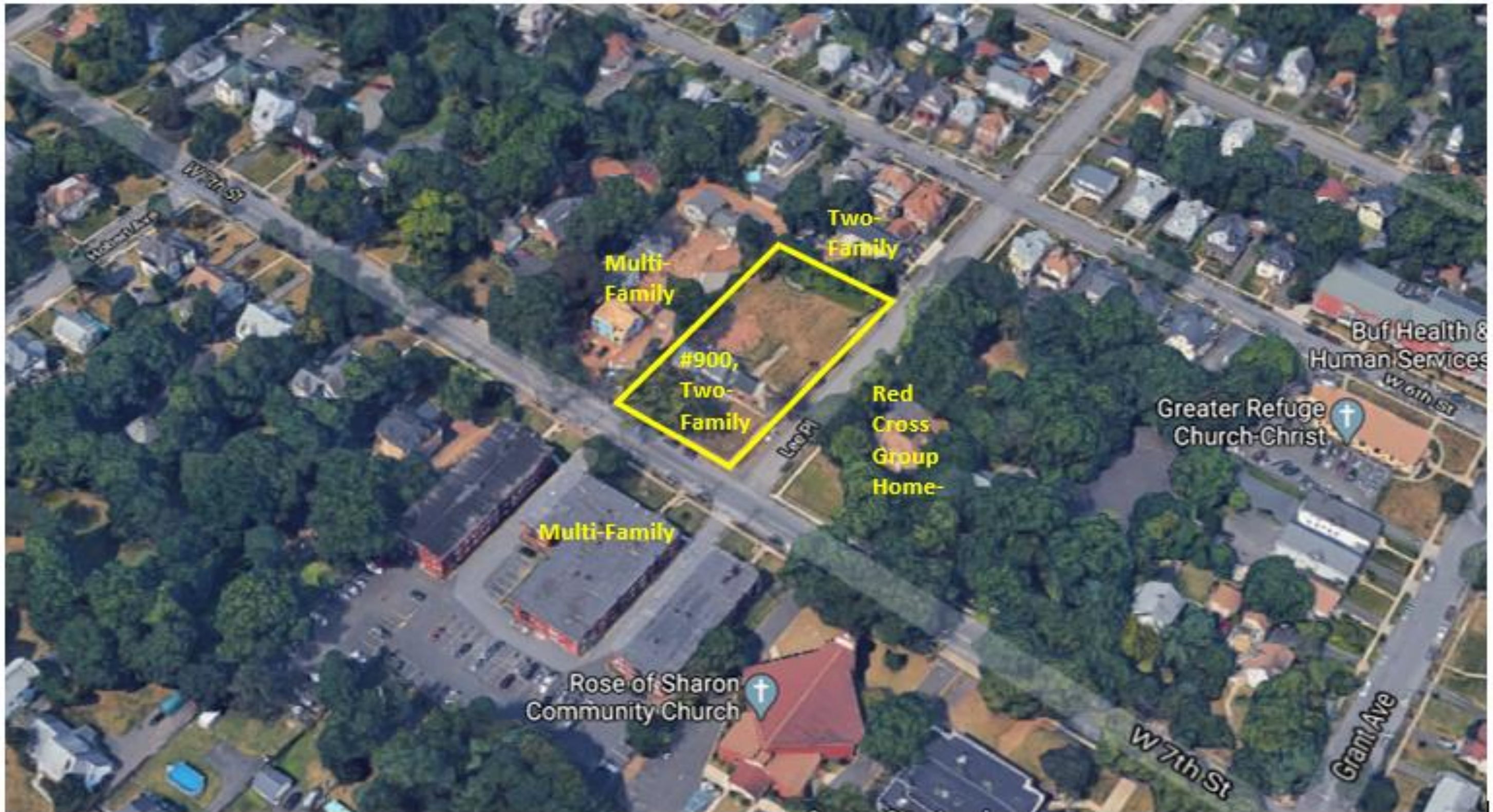
Image 1. Subject property at 900 W 7 th St, shown approximately in yellow highlight. North.