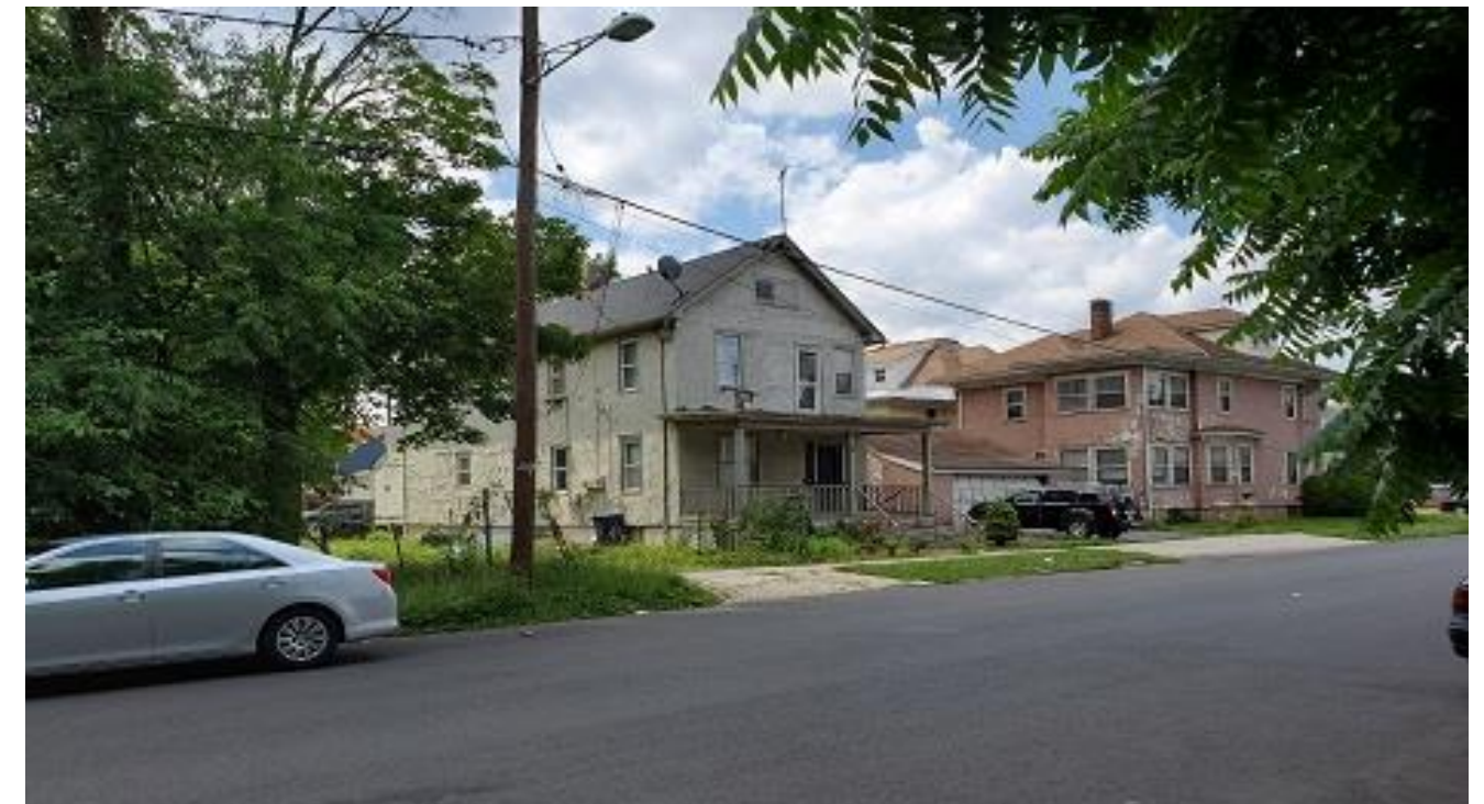
Image 7. Land use to north of subject proposed lot – two-family home in disrepair.