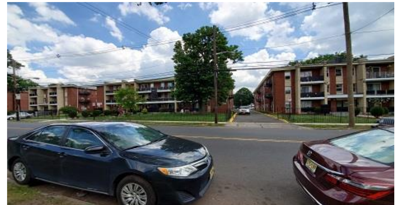
Image 9. Land use to south, across W 7 th St, 3 sets of 3-story garden apartments, including building from Image 8 shown at right.