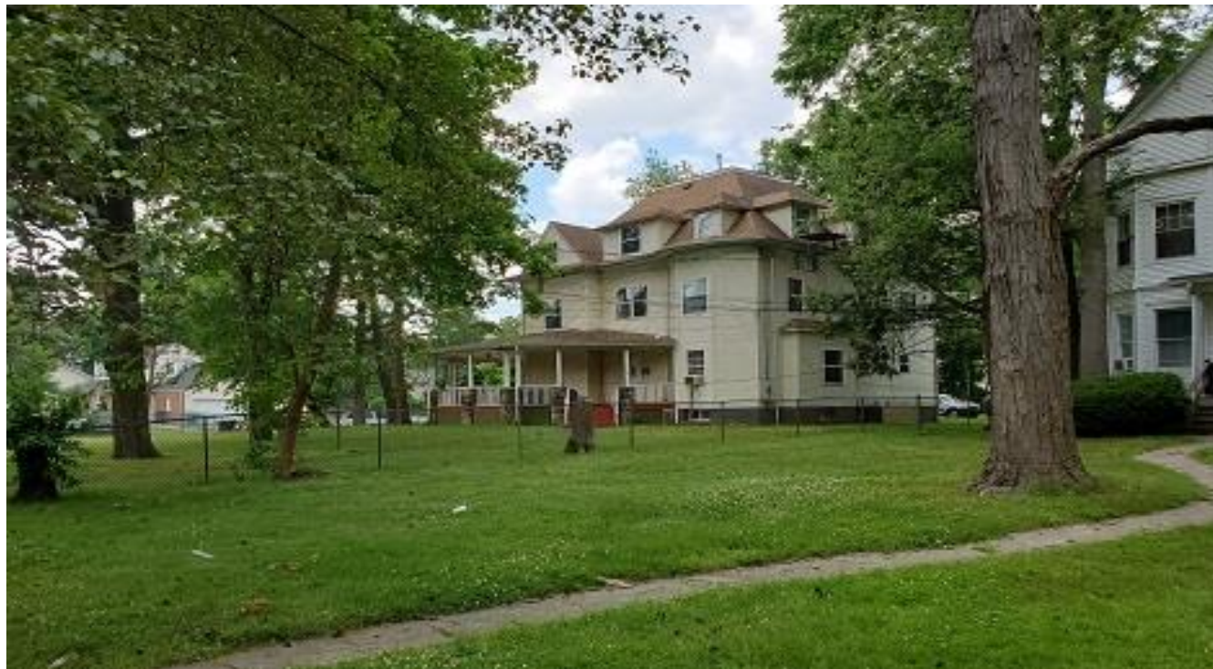
Image 6. Land Use to east - view toward front of Red Cross group home, from north side of W 7 th St.