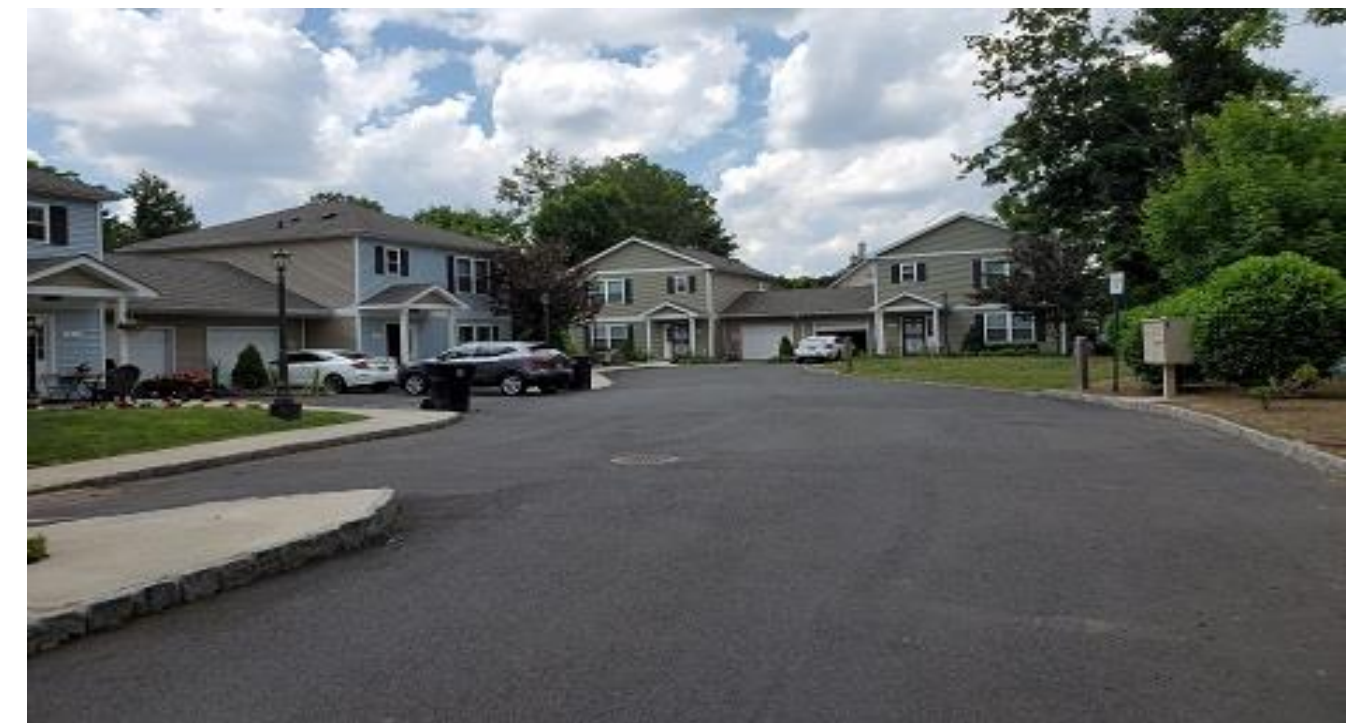
Image 5. View of interior of existing adjacent enclave of multiple attached homes on a single lot, looking north.