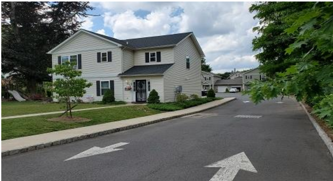
Image 4. Land use to west, existing enclave of 6 semi-attached homes on one lot, looking north.