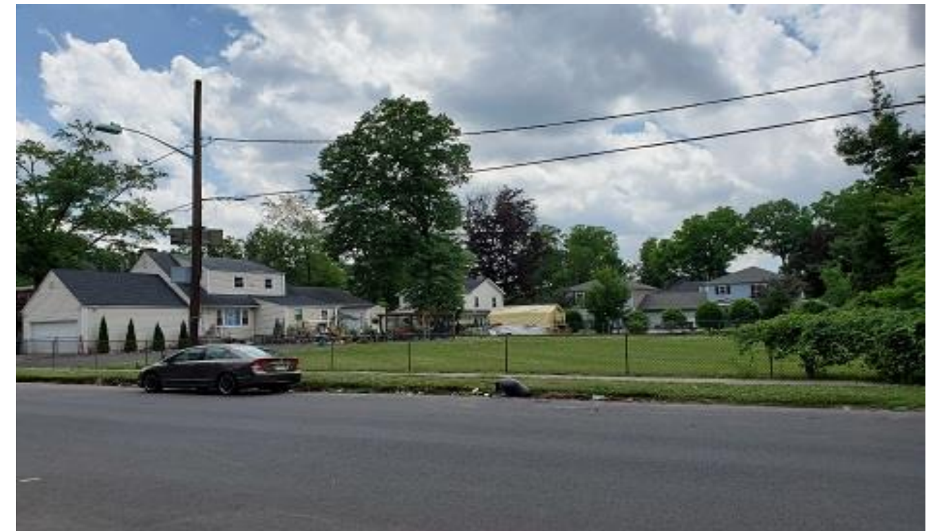
Image 3. View toward subject location of proposed single-family lot, looking southwest from Lee Place