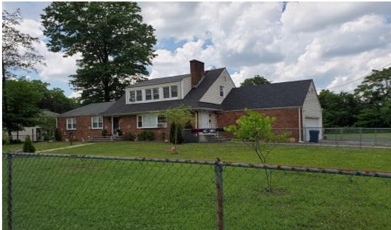
Image 2. View of subject existing 2-family home at 900 W 7 th St, from 7 th St, looking northwest.