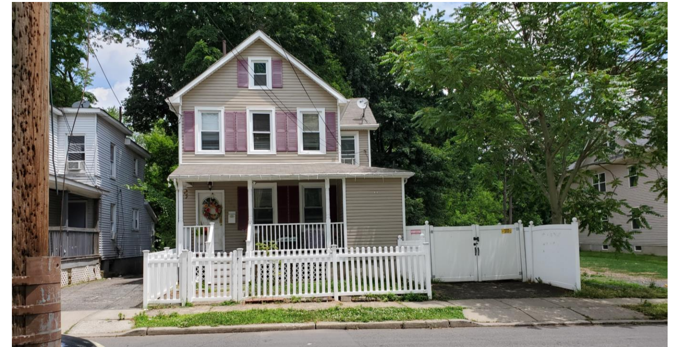
Image 5. View of existing adjacent single-family home at 121 Elmwood Place, looking northeast.