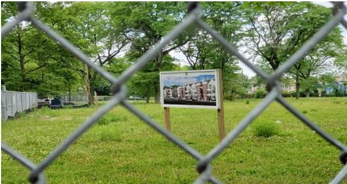
Image 8. Land use across Elmwood Place – Elmwood Gardens Redevelopment Area, site of planned multi-family housing.