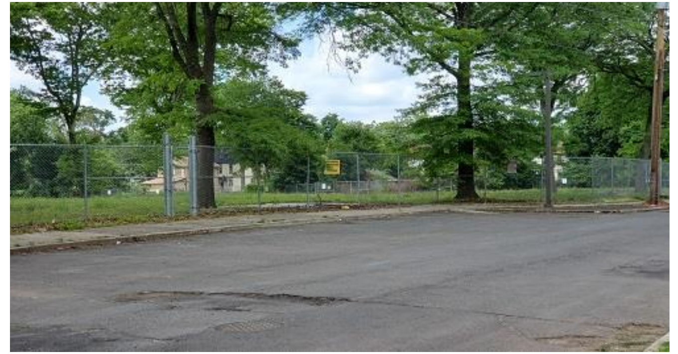
Image 13. View from sidewalk in front of 129 Elmwood Place to perpendicular parking area on west side of Elmwood Place.