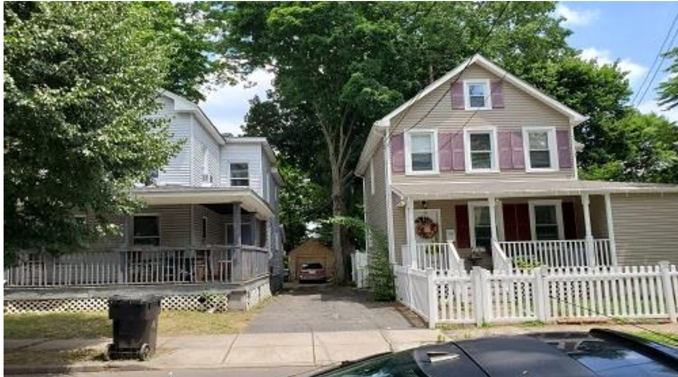
Image 10. View from Elmwood Place toward existing 2-family home at 119 Elmwood Place (on left) and single-family dwelling at 121 Elmwood Pl, adjacent to subject site