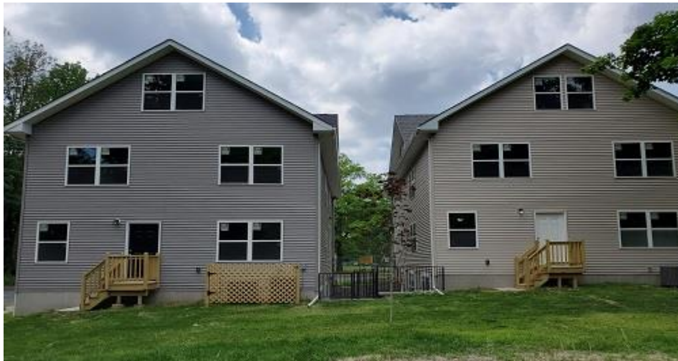
Image 12. View toward rear of two new two-family homes now under construction to immediate southeast of subject vacant lot. These homes are at 125 and 129 Elmwood Place.