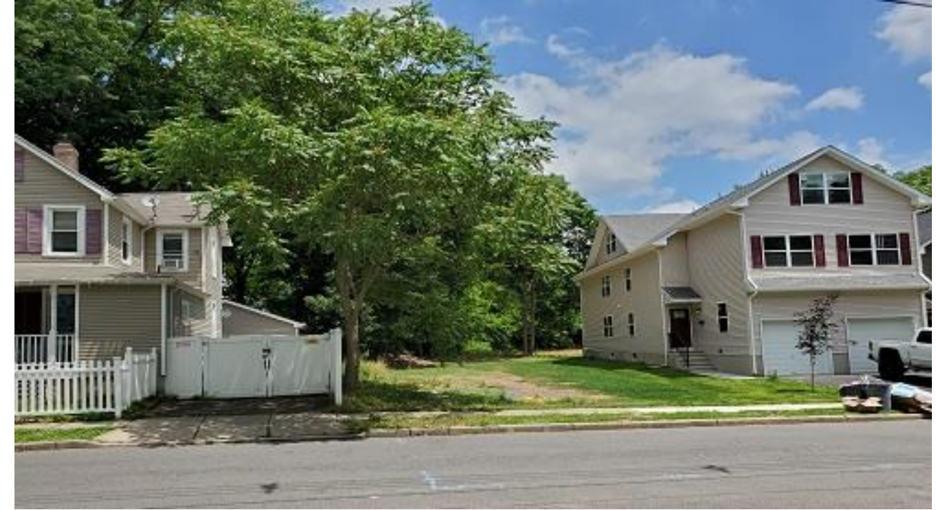
Image 11. View of subject vacant lot and existing residential structures to each side, from Elmwood Pl.