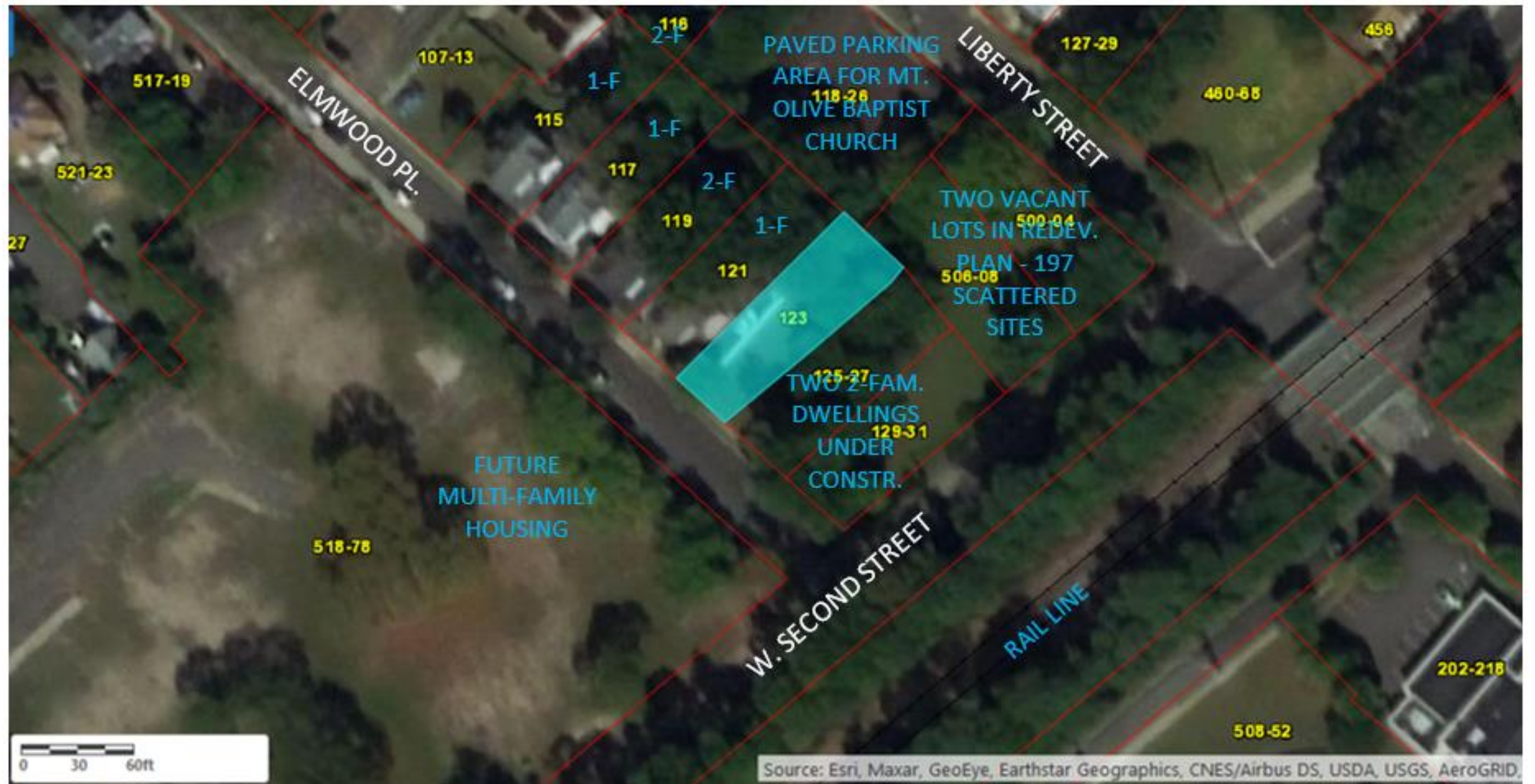
Image 1. Aerial view of subject neighborhood with property at 123 Elmwood Place shown in light blue highlight. N: ↑ .