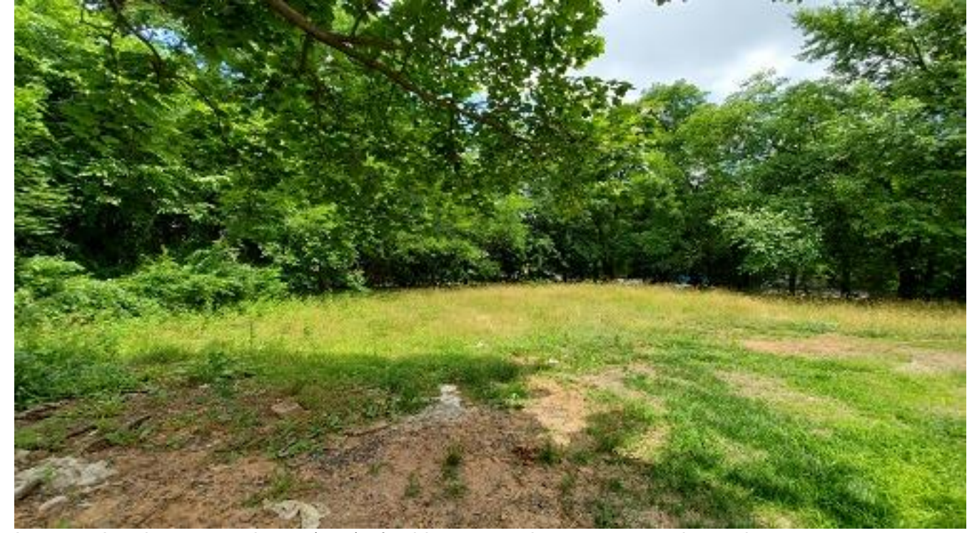
Image 7. Land use to northeast (rear) of subject vacant lot – two vacant house lots.