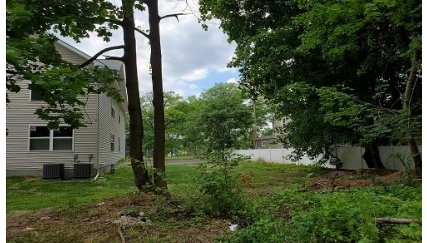
Image 3. View toward subject vacant lot from rear, Lot 10.03, Block 236.