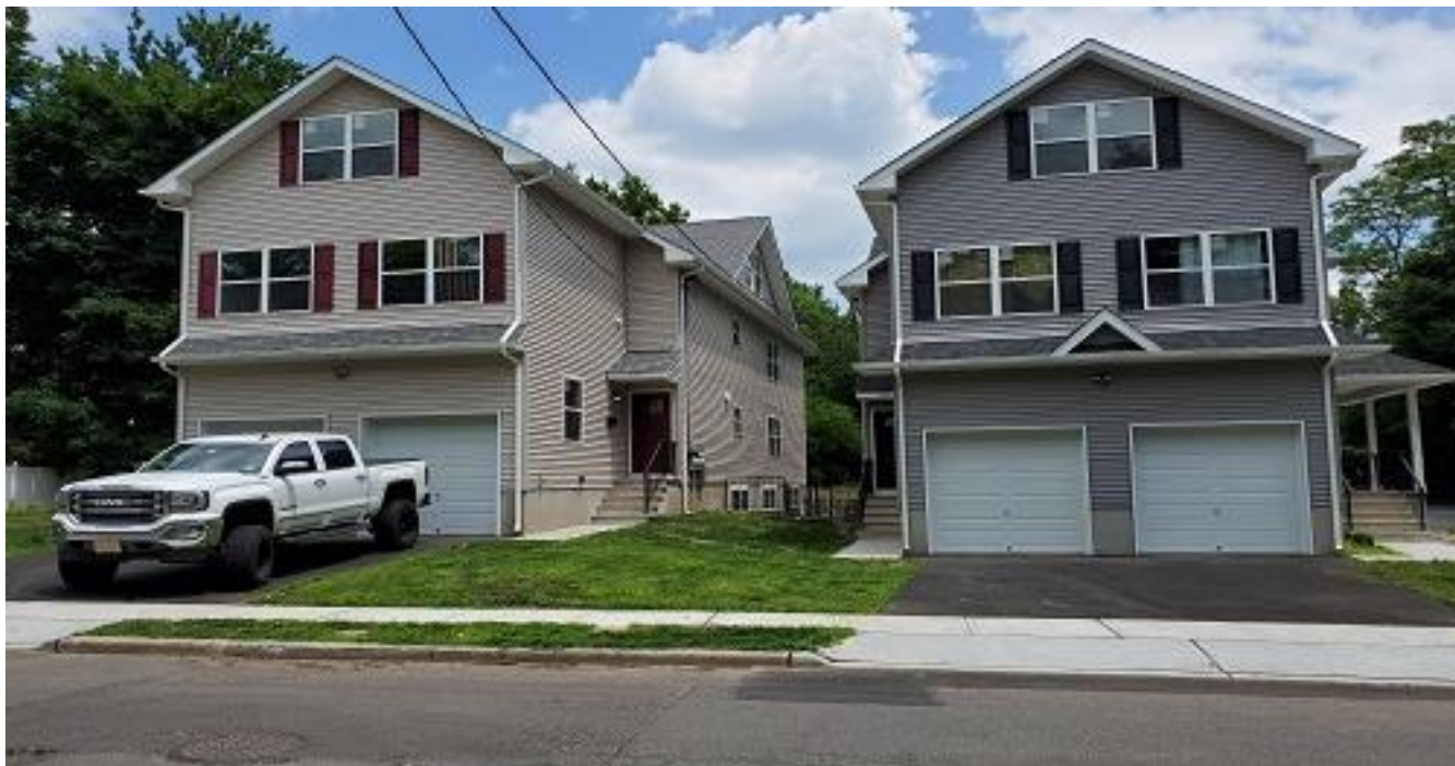
Image 4. View from Elmwood Place toward two adjacent 2-family homes now under construction to the southeast of subject vacant lot, looking northeast.