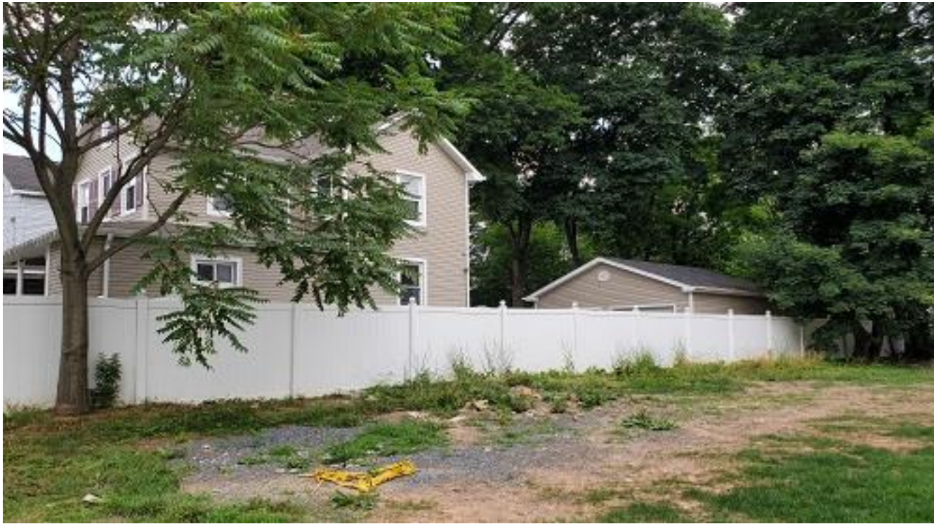
Image 6. View toward side of 121 Elmwood Pl, looking north from frontage of subject vacant lot.