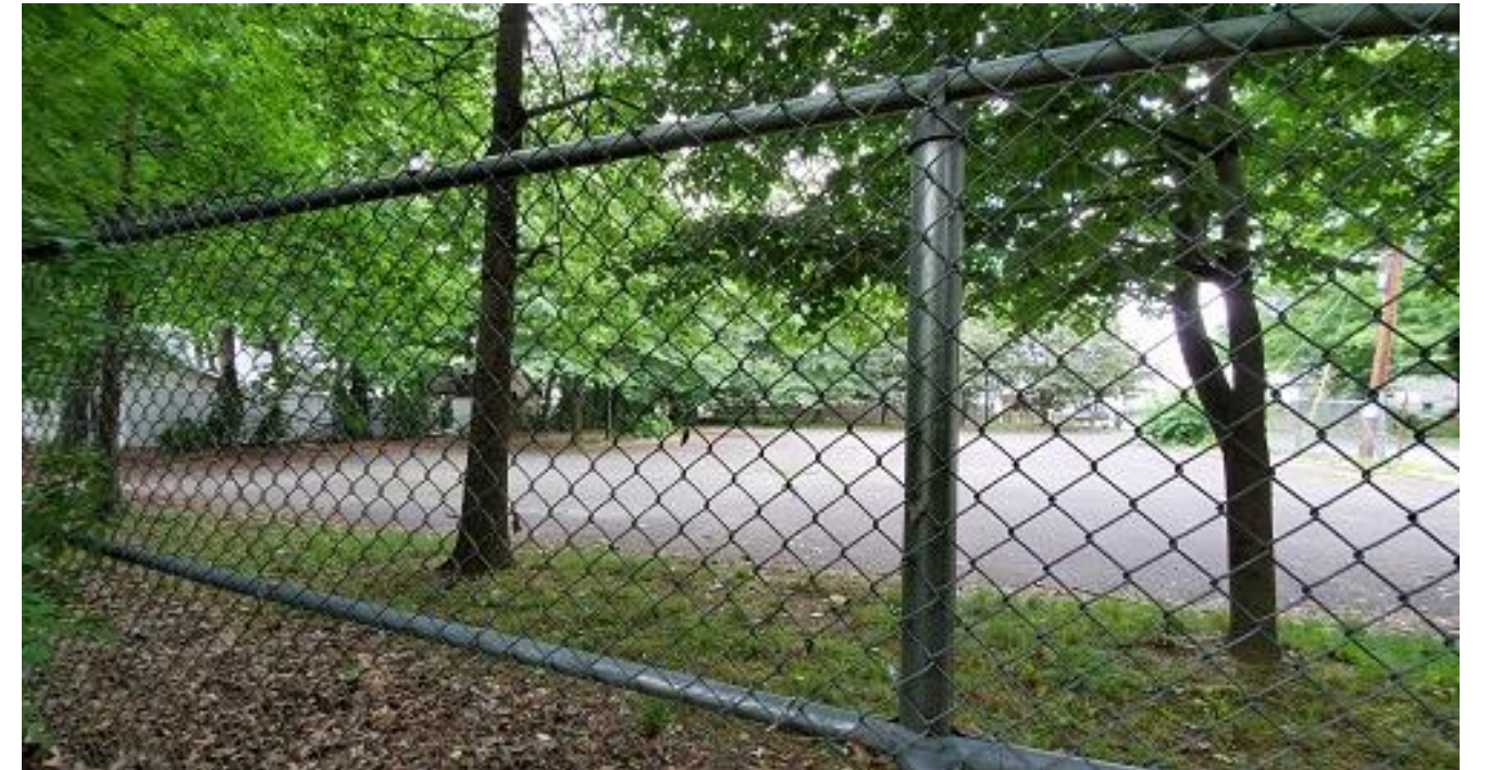
Image 9. Land use to rear left corner of subject vacant lot – paved parking lot for Mt. Olive Baptist Church use only.