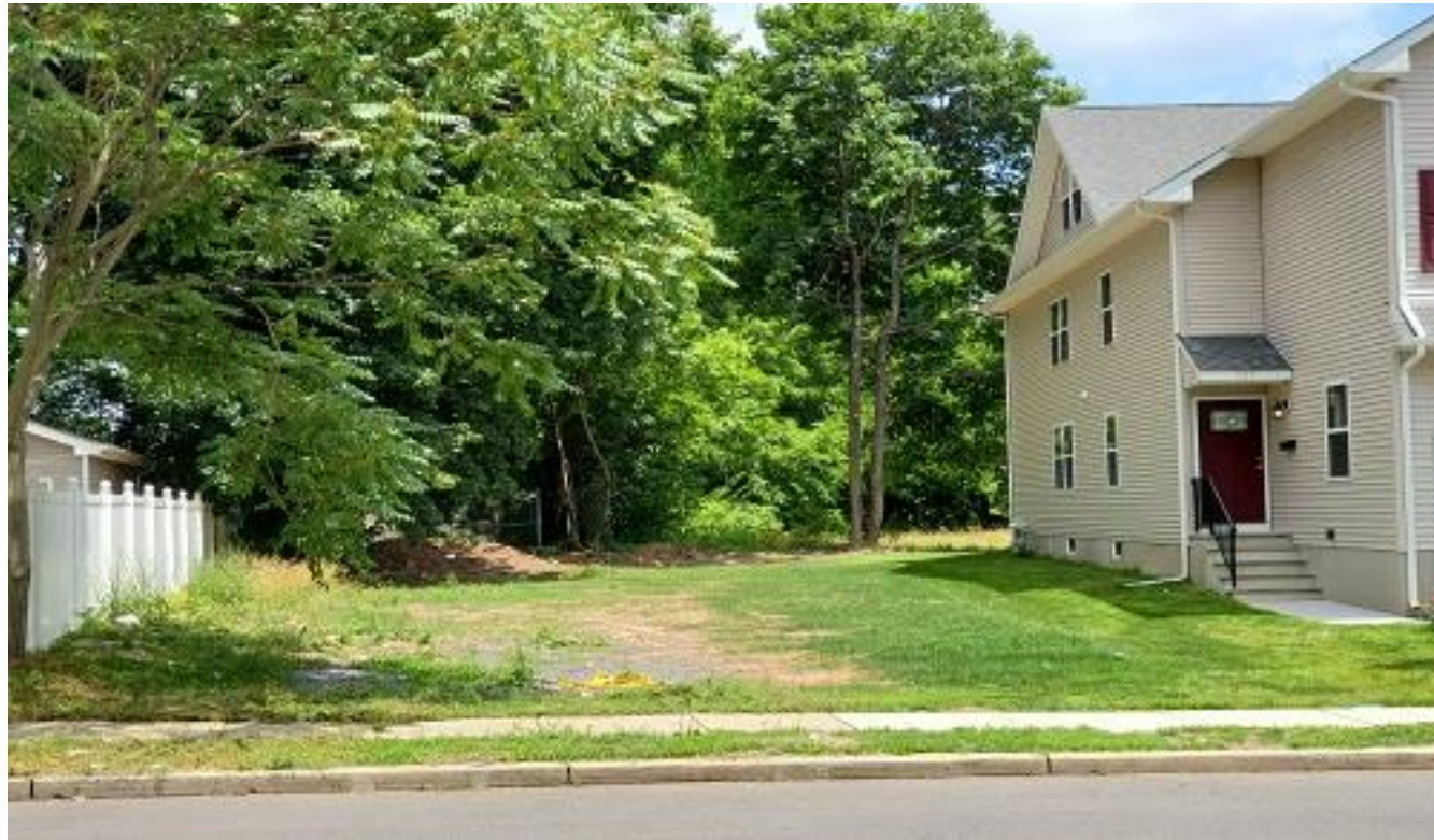
Image 2. View of subject vacant lot at 123 Elmwood Pl, from street, looking northeast.